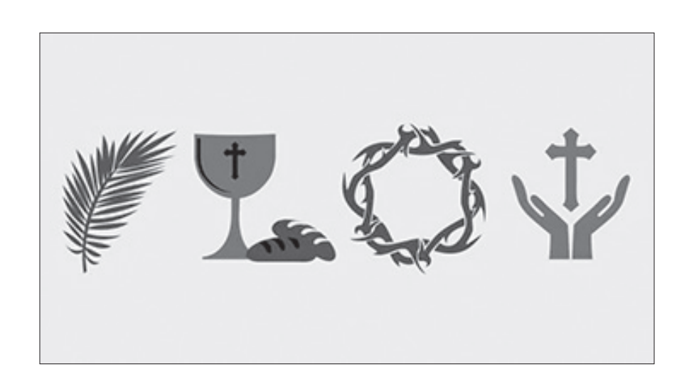
"I am the door"