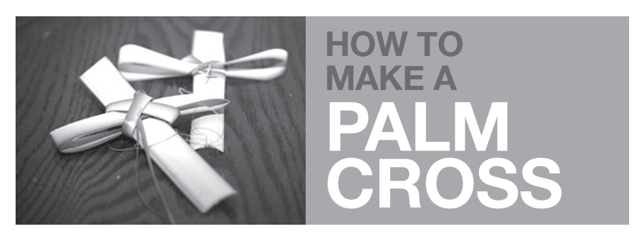
NEED: One palm leaf stip about 24"-26" in length, 1/2" in width, tapering to the end.